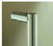
H470 End post