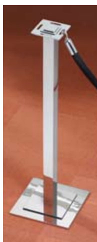
Bespoke Art Deco Post