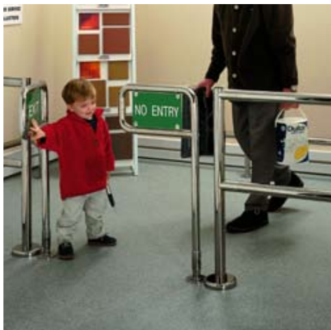
H581 / H470