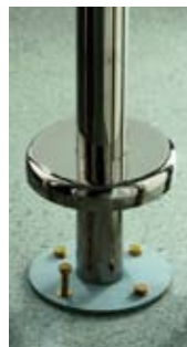
Post base & cover