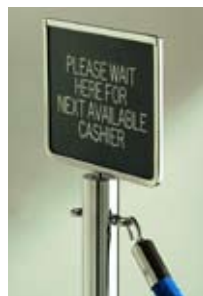
H452 / H161