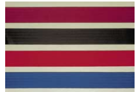
Strap Colours for H911

t +44 (0)121 331 1903 f +44 (0)121 331 1900 e info@savekers.com w www.savekers.com