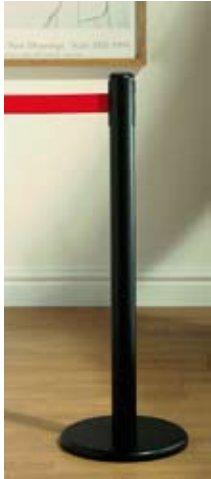
Retractable Barrier System