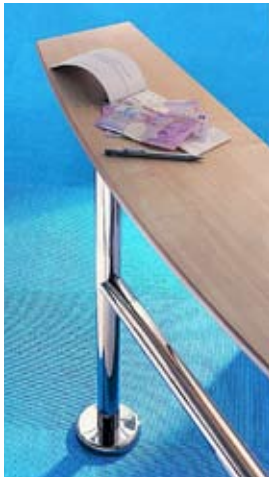
H470 Barrier with writing top