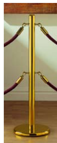
H1117 / H575 / H574