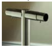
H470 Centre post