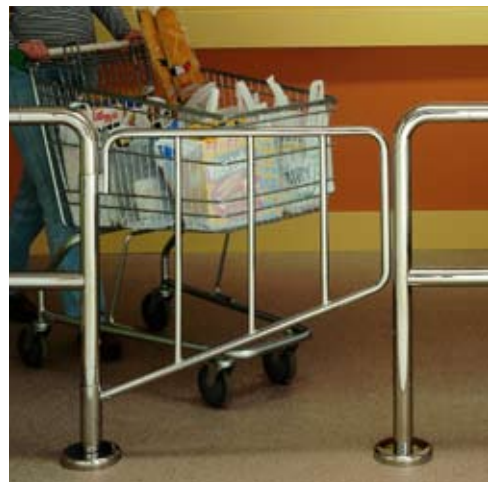
H1934 / H535

H269 Counter corner protection bollard. 51mm or 76mm diameter, 550mm high with 150mm diameter welded base and coverplate. Chrome. Satin Chrome. Stainless Steel.