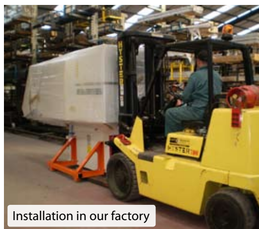
Installation in our factory