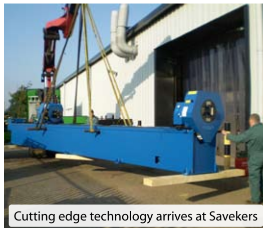
Cutting edge technology arrives at Savekers